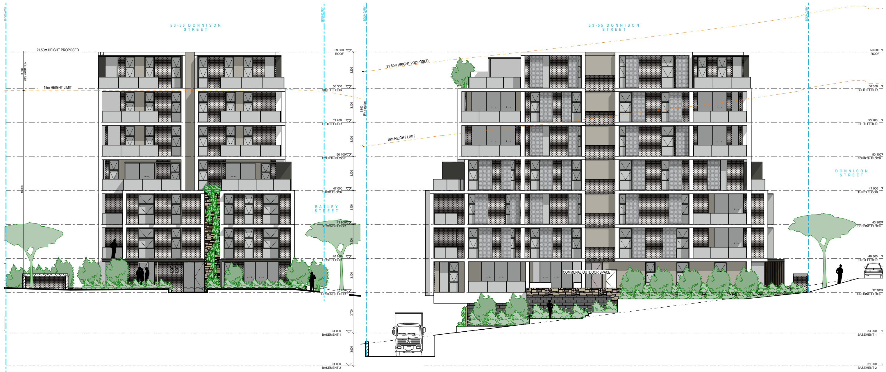
E-01 NORTH ELEVATION 1:200 E-02 EAST ELEVATION 1:200