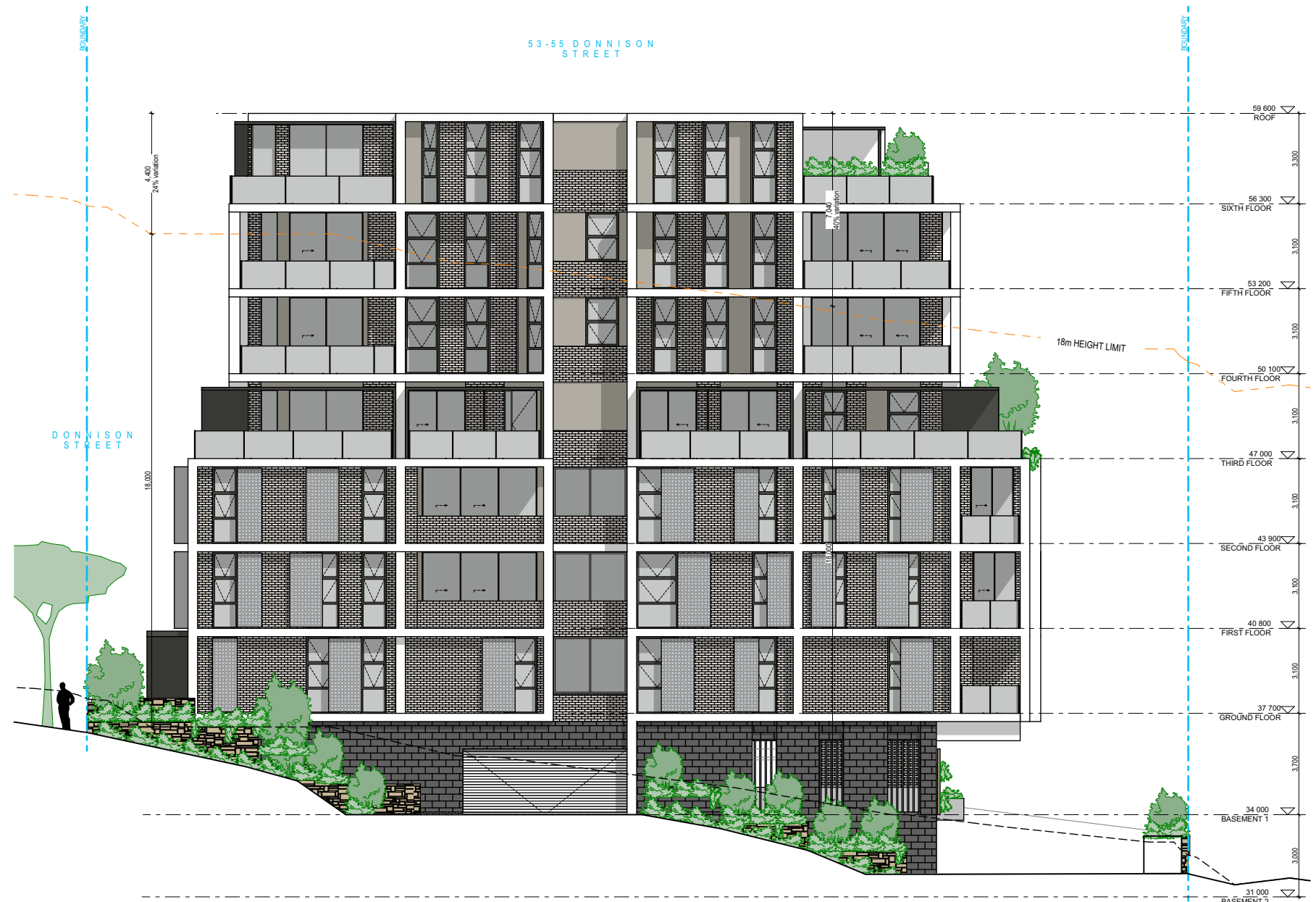
SOUTH ELEVATION 1:200